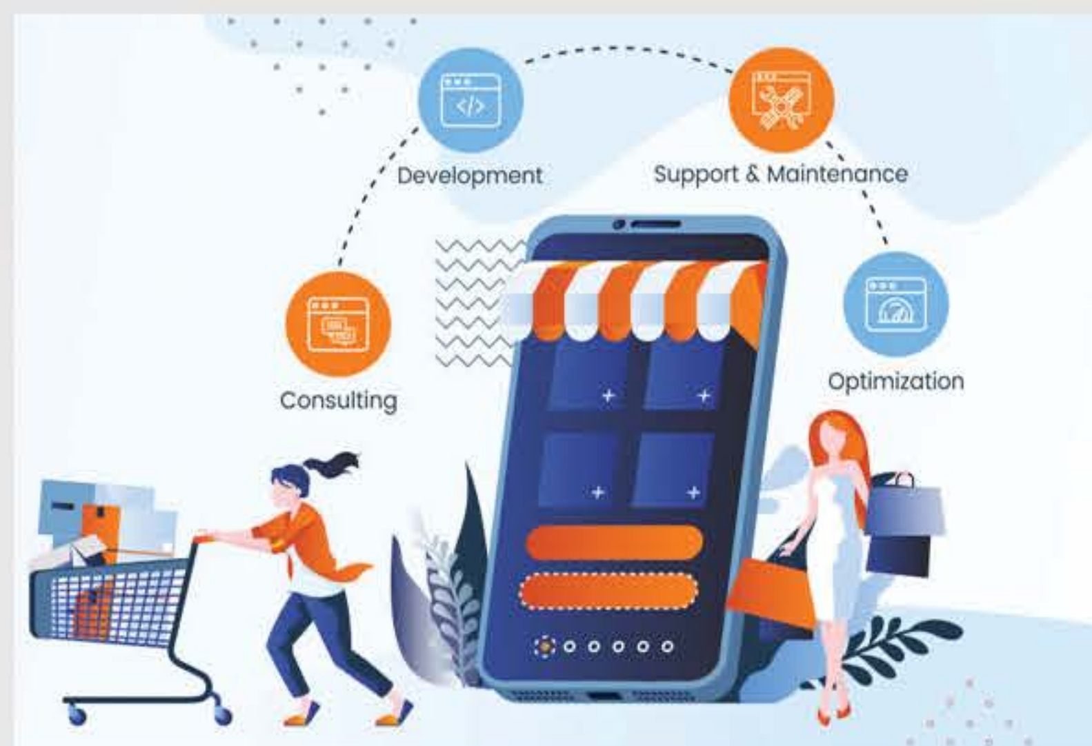
E-Commerce & Retail